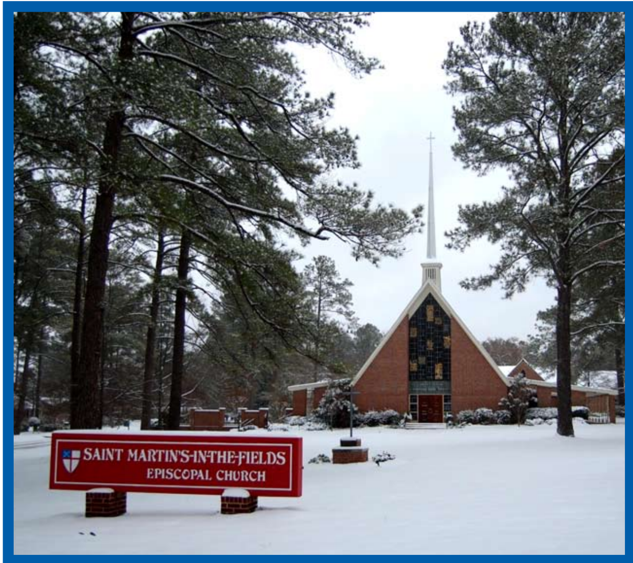
February 2010

O ye dews and frosts, bless ye the Lord; O ye frost and cold, bless ye the Lord; O ye ice and snow, bless ye the Lord; praise him and magnify him for ever.